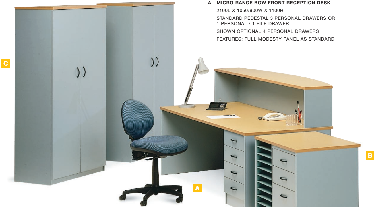
A MICRO RANGE BOW FRONT RECEPTION DESK 2100L X 1050/900W X 1100H STANDARD PEDESTAL 3 PERSONAL DRAWERS OR 1 PERSONAL / 1 FILE DRAWER SHOWN OPTIONAL 4 PERSONAL DRAWERS FEATURES: FULL MODESTY PANEL AS STANDARD