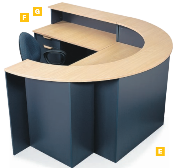
E MICRO RANGE CURVED RECEPTION-UNIT 2100L X 1050D X 1100H OPEN UNDER STANDARD WITH FULL FRONT PANEL AND RECEPTION COUNTER F MICRO RANGE DRAWER PEDESTAL 3 PERSONAL DRAWERS 1 PERSONAL / 1 FILE DRAWER G MICRO RANGE CURVED RECEPTION UNIT RETURN 1200L X 600W STANDARD OPEN UNDER WITH BUILT IN COUNTER TOP